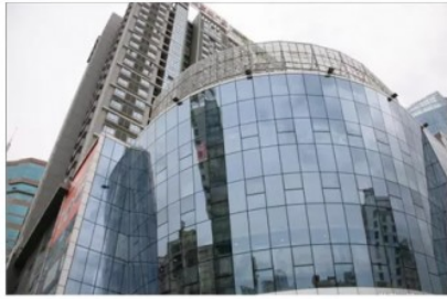
Suit for glass curtain wall sealing and gap filling