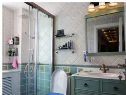
Suit for bathroom sealing and gap filling