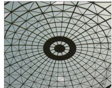
Suit for sunlit room sealing and gap filling