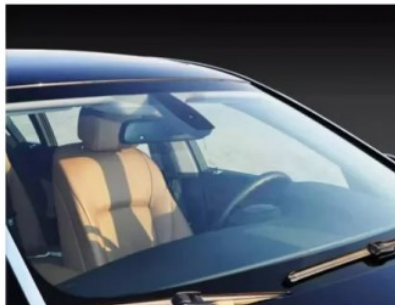
Suit for auto glass sealing and gap filling