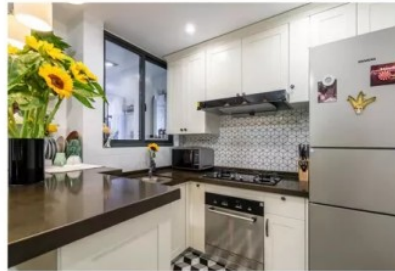
Suit for kitchen sealing and gap filling